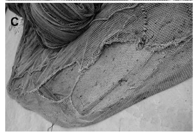
Figure 2: Examples of the major structural causes of escape incidents from Norwegian cage farming: (A) progressive mooring failure; (B) breakdown and

sinking of steel fish farms; and (C) abrasion and tearing of nets. Source: Jensen et al. , 2010.