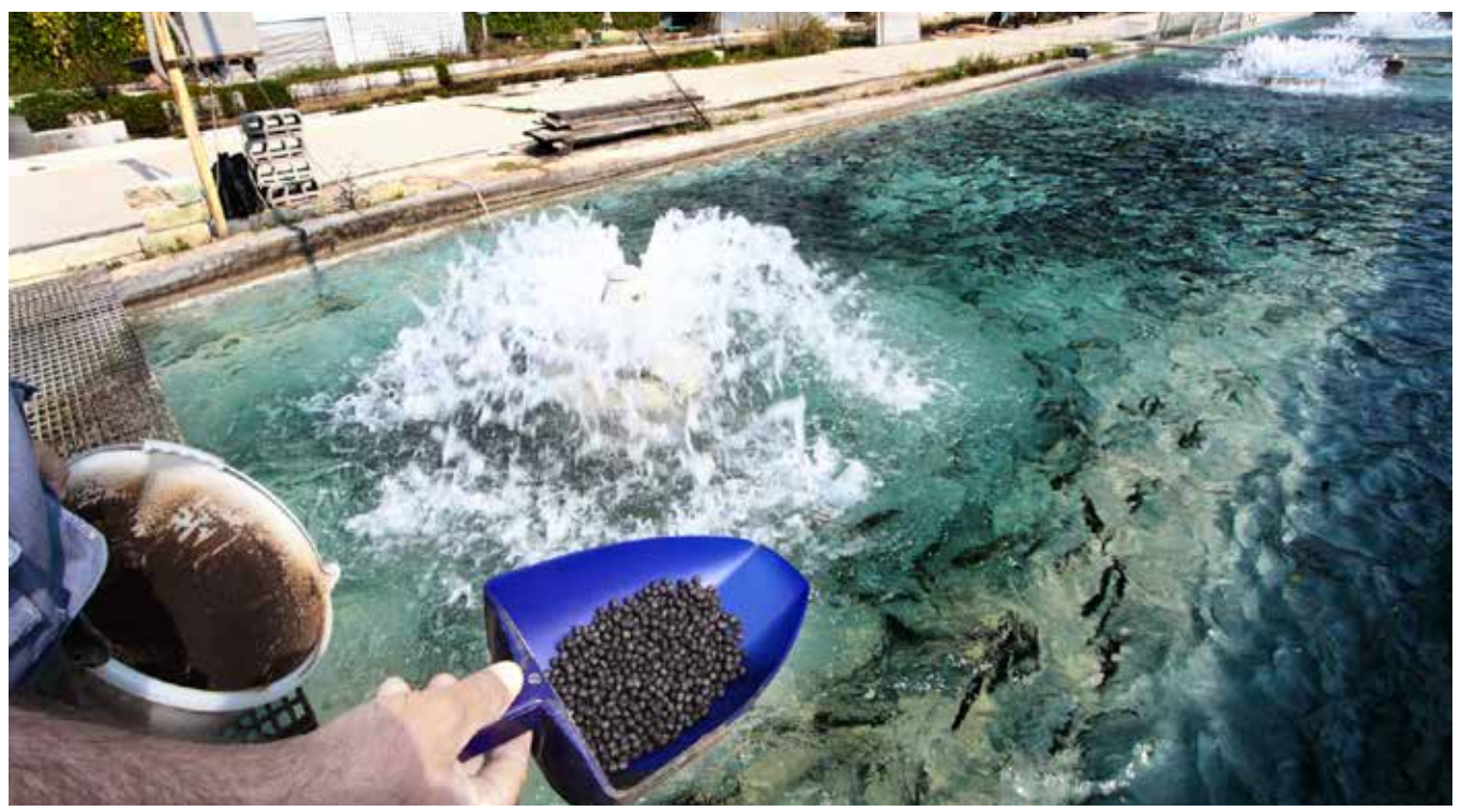
Fish farm at Bussi, in Abruzzo, Italy.

Aquaculture is facing a new era of expansion in Europe. What are the environmental implications of this, and how can the sector expand sustainably? This Future Brief from Science for Environment Policy presents an overview of research into aquaculture's impacts, and considers how it could develop in harmony with environmental goals.